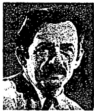
THOMAS BENTON Painter, muralist, lithographer — Benton has created murals for the Whitney Museum of American Art, New School for Social Research, Missouri State Capitol, and other public buildings.

THOMAS BENTON, JOHN STEUART CURRY, BOARDMAN ROBINSON, GEORGE GROSZ and other famous American artists have illustrated these beautiful editions in color, at this amazingly low price!